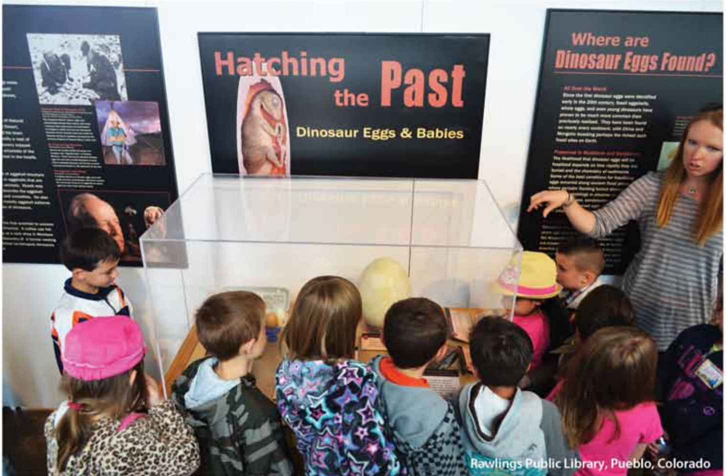
Rawlings Public Library, Pueblo, Colorado

"Hatching the Past" is proud to present our newest and smallest exhibit, "Nesting with Dinosaurs." This compact exhibition packs all the drama, excitement and educational content of our larger "Dinosaur Eggs and Babies" traveling exhibitions. "Nesting with Dinosaurs" recently opened at the Quarry Hill Nature Center in Rochester, Minnesota with rave reviews from the most important patrons, the kids, but it is also designed to appeal to families, schools and children of all ages.