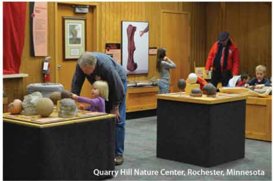
Quarry Hill Nature Center, Rochester, Minnesota