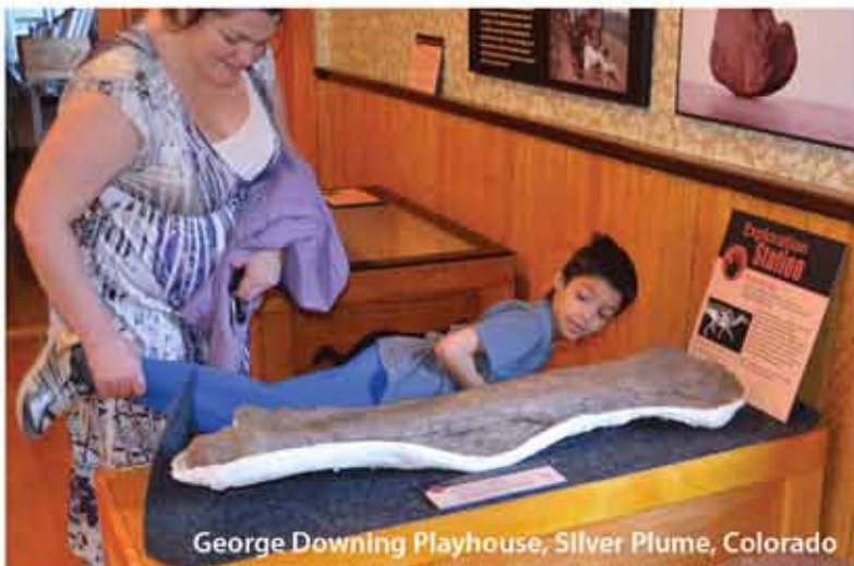
George Downing Playhouse, Silver Plume, Colorado

Eight educational computer games including: Dino Word Search, Paint Shop and Fossil Hangman